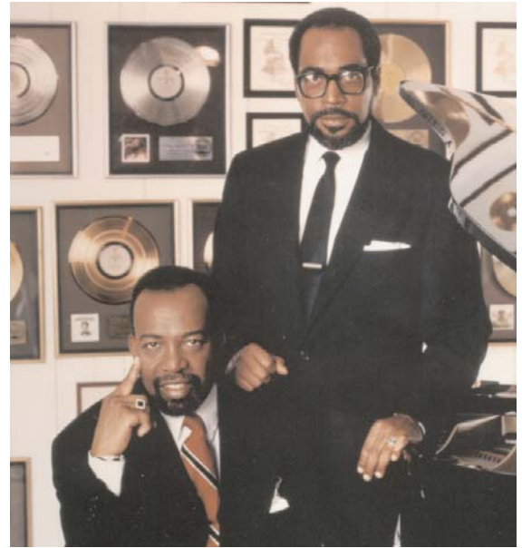
Leon Huff and Kenneth Gamble, legendary creators of The Sound of Philadelphia

The dynamic duo's astonishing work continues to shine bright