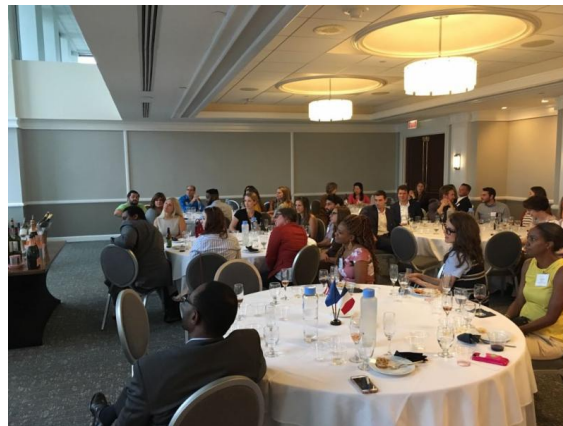
7/31 WINE TASTING 101 PHOTOS